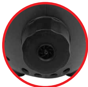
2 Flow Rate Nozzles included in F-8 Models