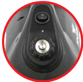
Droplet Size / Flow Rate Adjustment