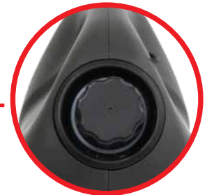
Easy Fill Reservoir