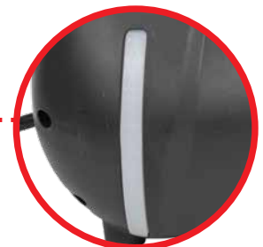
Reservoir Level Window to Monitor Liquid Levels