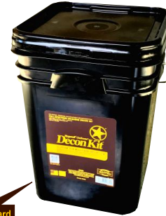
P/N: DKS008 On-Scene Decon Kit. REFILLABLE - REUSABLE

Contents includes the same as above DKS008, with the addition of Hygenall HandScrub for heavy grease and HAZMAT cleaning, and Pocket Size Hygenall FieldWash, Non-Rinse version for chemical and drug residue decontamination.