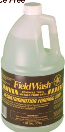
P/N: FFSHW8001G Hand, Hair and Body Wash