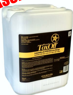
P/N: HTL12005G Hygenall ToxOff Laundry/Extractor & PPE Decon Detergent Passed NFPA 1851 Testing!