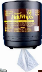
P/N: FWWM501 500 Wipe Wall Mounted Decon Station Dispenser REFILLABLE