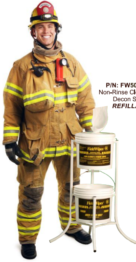
P/N: FW501NRDS Non-Rinse Cleaning and Decon Station REFILLABLE