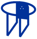
P/N: GR01 Gallon Bottle Wall Bracket