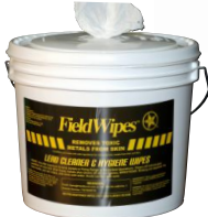
P/N: FW501NRTB 500 Wipe Bucket REFILLABLE